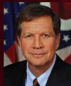
John R. Kasich