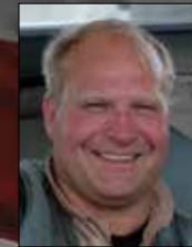
LT COL Kevin Sonnenberg 180th Fighter Wing Toledo, Ohio June 15, 2007