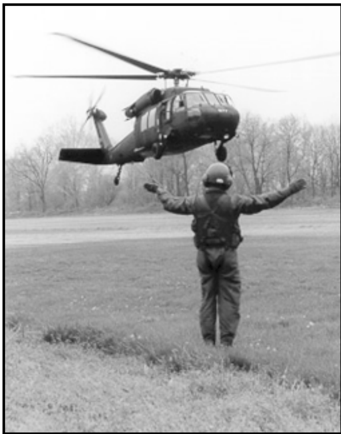
The Ohio Army National Guard began modernizing with UH-60 “Black Hawk” helicopters during FY00.

ronmental Protection Agency (OEPA) approval to winter-over the training site.