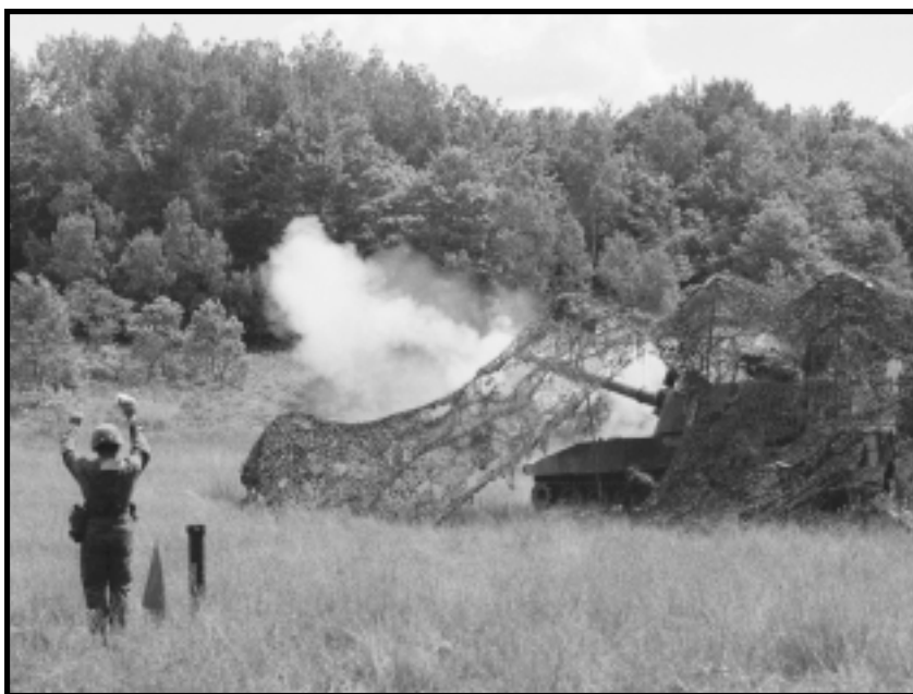
A crew from the 1-134 Field Artillery Battalion fires an M109-SP Howitzer cannon during annual training at Camp Grayling, Mich.

During FY00, the brigade conducted Abrams Tank Gunnery (crew qualification tables) at Camp Grayling, Mich.,