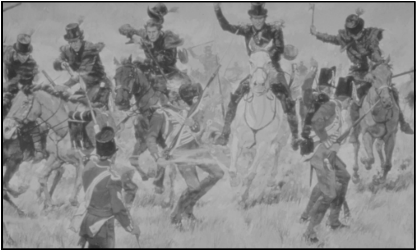
Gen. Harrison's command included a regiment that scattered the enemy army during the Battle of the Thames.

T he Ohio National Guard originated in Marietta on July 25, 1788, when the first law passed providing for the establishment of the militia in what was then the Northwest Territory. The militia was ordered out in the spring of 1812 to defend the American post at Detroit from the British and Indians during the War of 1812.