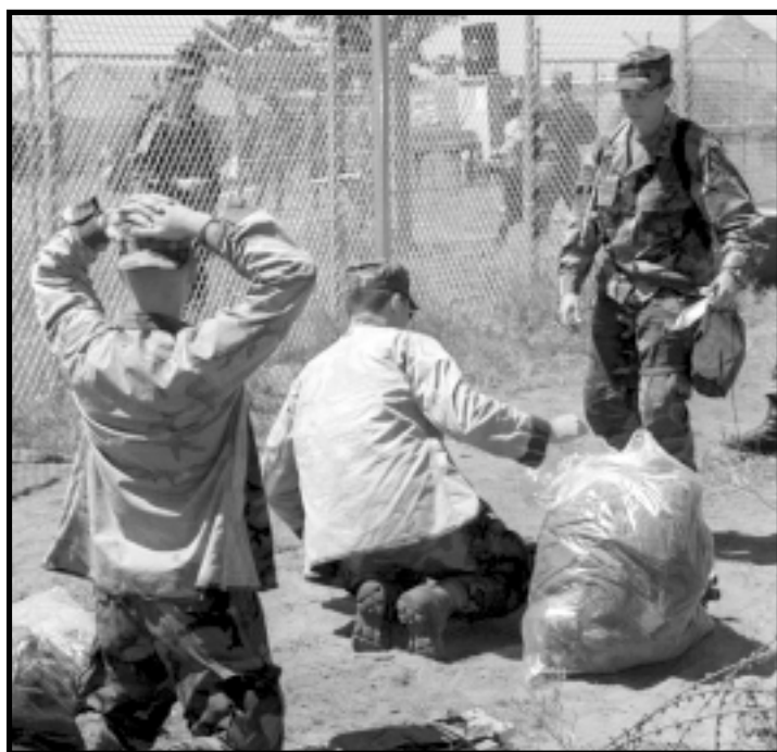
The 324th Military Police Company rehearses its new enemy prisoner of war mission at Fort McCoy, Wisc.

Units of this command accomplish a diverse array of missions to include military police operations, personnel services, maintenance, medical support, logistical support, water purification, transportation and public affairs. Some of the more specialized units include a special forces com-