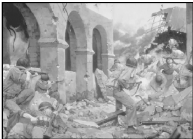
The 37th Division captured the heavily fortified city of Manila.

During the buildup of forces in Vietnam, the 121st Tactical Fighter Group stationed at Lockbourne Air Force Base (now Rickenbacker Air National Guard Base) was called to active duty. The group remained on active duty until 1969 and consistently completed successful sorties in support of the Southeast Asian theater of operations. Though some Ohio Army National Guard units were deployed to Southeast Asia, many Vietnam veterans