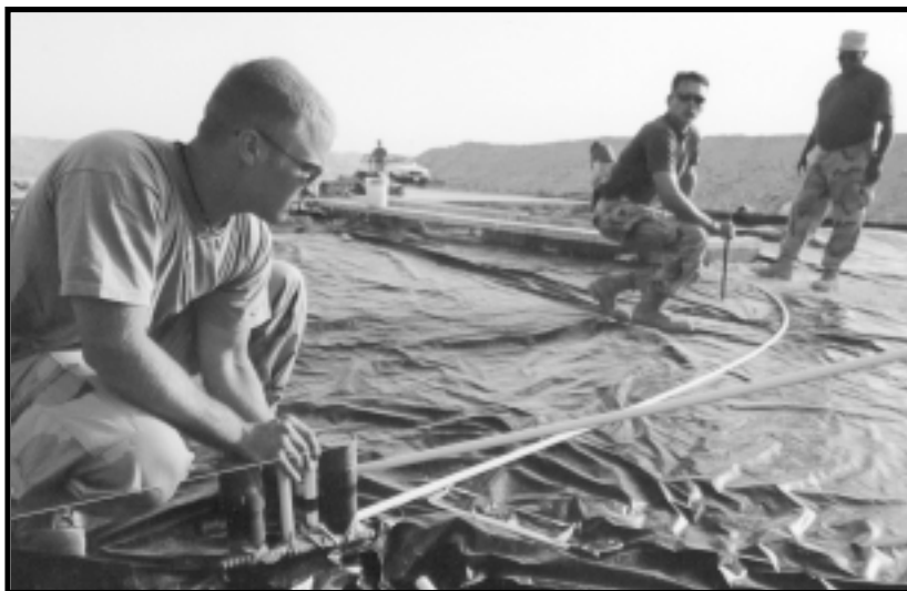
Members of the 200th RED HORSE Squadron construct a K-span building at Camp Snoopy in Doha, Qatar.