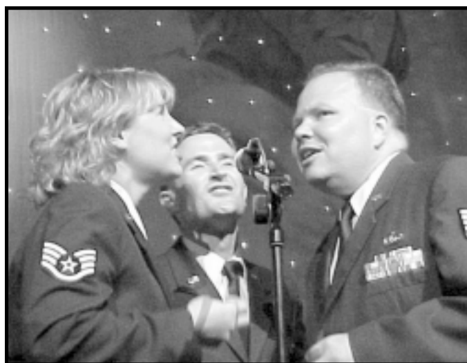
The Triple Nickle performed at a hangar dance during the famed Royal International Air Tatoo in England.

During this reporting period, the weather flight completed annual training in support of the 155th Separate Armored Brigade of the Mississippi Army National Guard at Camp Shelby, Miss. During this exercise, the 164th was the first Guard weather flight to be rated as "outstanding" by the Air Combat Command inspector general while supporting the Army in the field during an Operational Readiness Inspection. Also during this fiscal year, one unit member deployed to the base weather station at Incirlik, Turkey, for two weeks on an Air Expeditionary Force rotation.