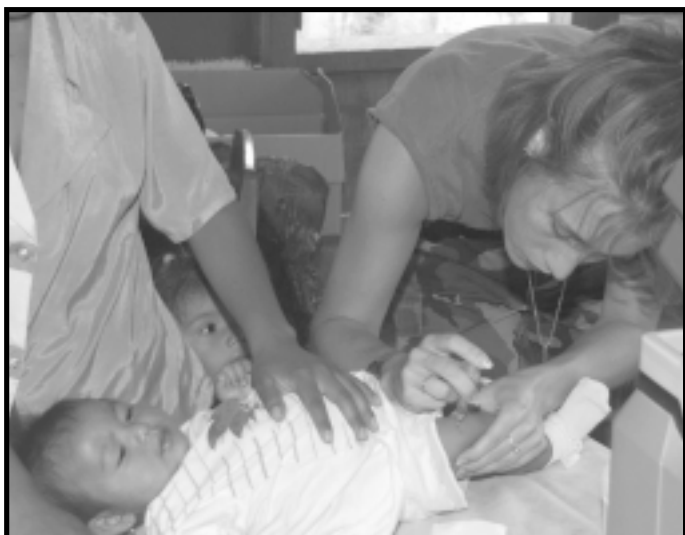
Medics from the 178th Fighter Wing deployed to Belize, visiting nine villages and treating about 3,000 people.

drones. From Jan. 22 to Feb. 5, 2000, about 75 unit members deployed to Savannah, Ga., for Dissimilar Aircraft Training.