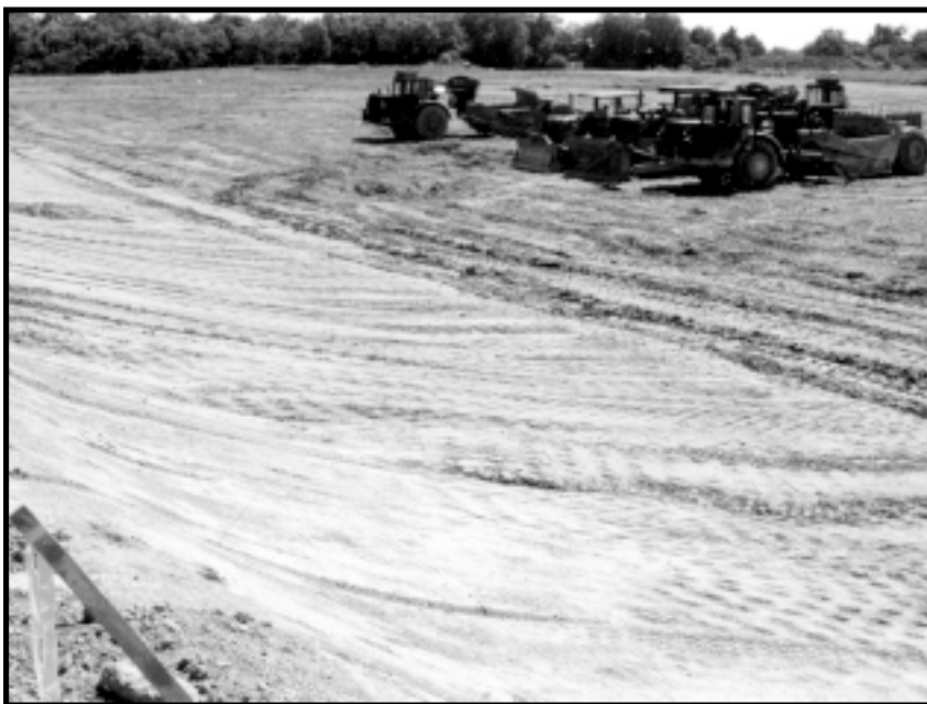
Engineers moved nearly 25,000 cubic yards of dirt to build two berms for an Armor Moving Target System at the Ravenna training site.

RTLS served as the annual training site for the 216th Engineer Battalion this year, with the battalion completing major portions of two major wetland mitigation projects mandated by the U.S. Army Corps of Engineers. Consolidated troop labor from battalion units finished several other small projects at RTLS and worked to receive Ohio Envi-