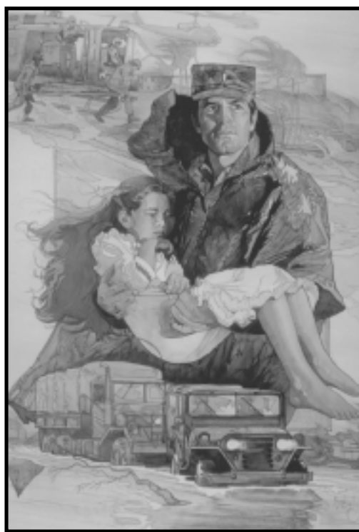
The Ohio National Guard’s dedication to service begins in the community.

From Main Street, Ohio, to Inicrlik, Turkey, the Ohio National Guard has served the nation and the state of Ohio proudly and will continue to do so into the future.