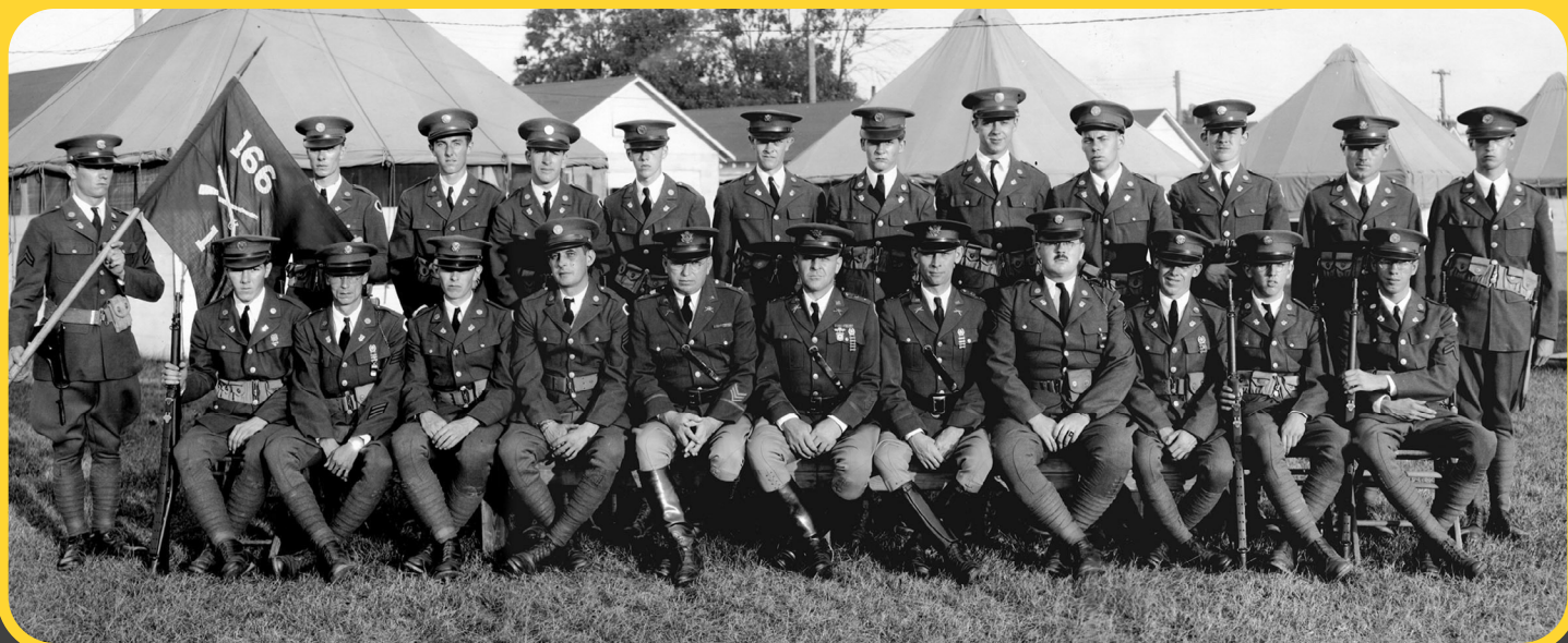
Headquarters Company, 1st Battalion, 166th Infantry, 37th Division, Camp Perry, Ohio, 1935.