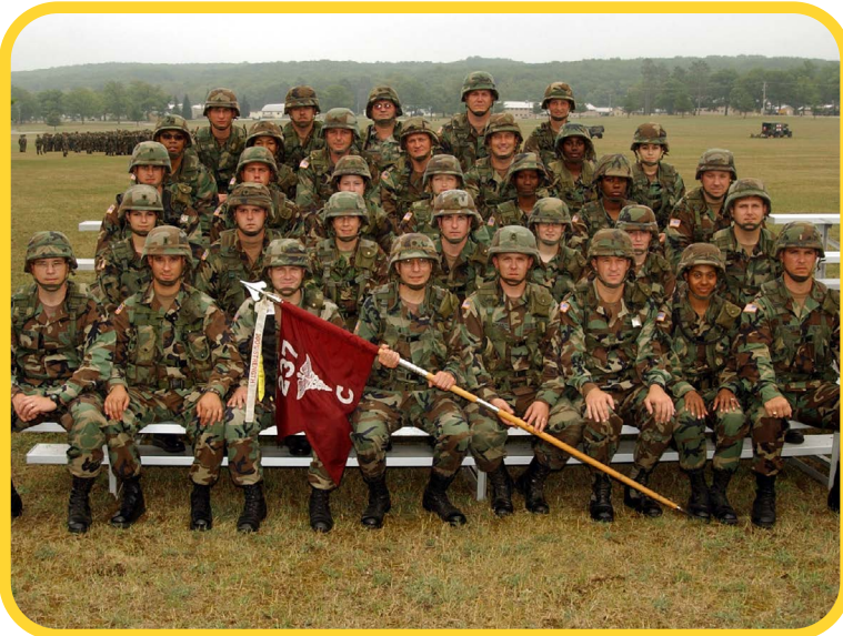
Company C, 237th Support Battalion, 37th Brigade, 38th Infantry Division, Camp Grayling, Mich., 2005.