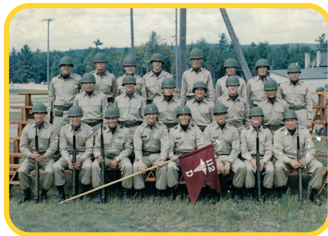
Company D, 112th Medical Battalion, 37th Infantry Division, Camp Grayling, Mich., 1965.

Converted, reorganized and redesignated 1 April 1963 as Company D, 112th Medical Battalion