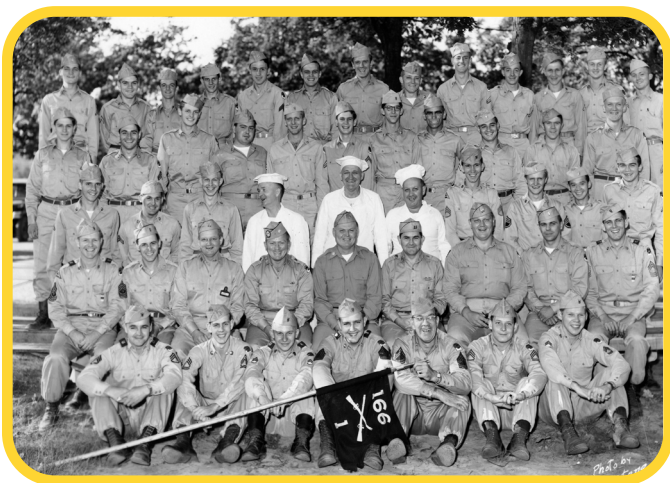
Headquarters and Headquarters Company, 1st Battalion, 166th Infantry, Camp Grayling, Mich., 1953.