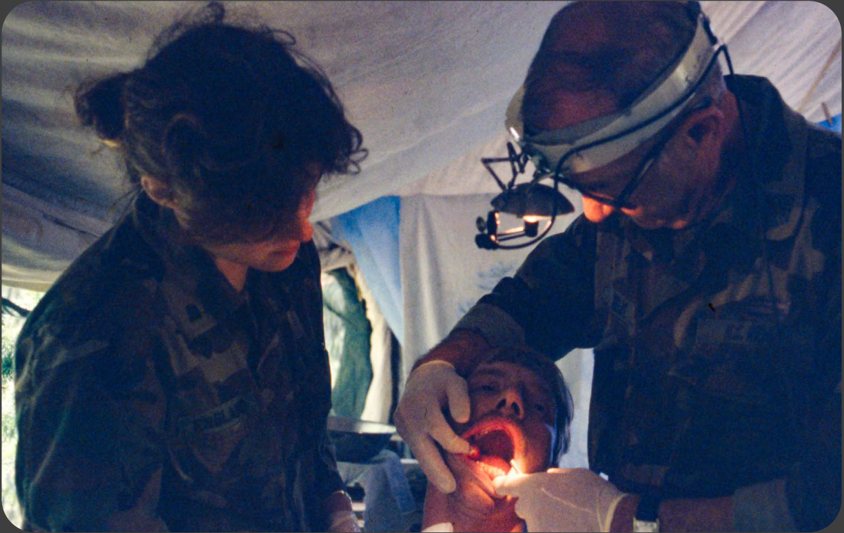
A dentist from Company B, 237th Support Battalion, 73d Infantry Brigade, looks at a Soldier's teeth in the field during annual training at Camp Grayling, Mich. in 1984.

Ordered into active Federal service 7 August 2022 at Columbus; released from active Federal service 10 September 2023 and reverted to state control