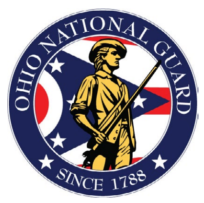
Updated as of March 27, 2023

This historical sketch is published IAW AGOR 870-5 by the office of the Historian, Ohio National Guard. This history reflects the approved lineage and honors of the unit as determined by the U.S. Army Center of Military History. All photographs used, unless otherwise cited, are from the Ohio National Guard Heritage Center. Errors, corrections and suggestions may be submitted to: