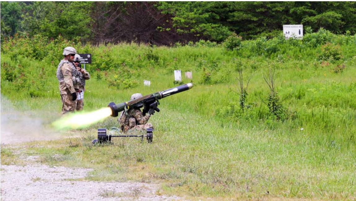
2017: Soldiers from the 812th Engineer Company conduct live-fire exercises with the Javelin weapon system — a one-man-portable, antitank, guided munition and surveillance weapon system, during their annual training at Fort Knox, Ky., in 2017.