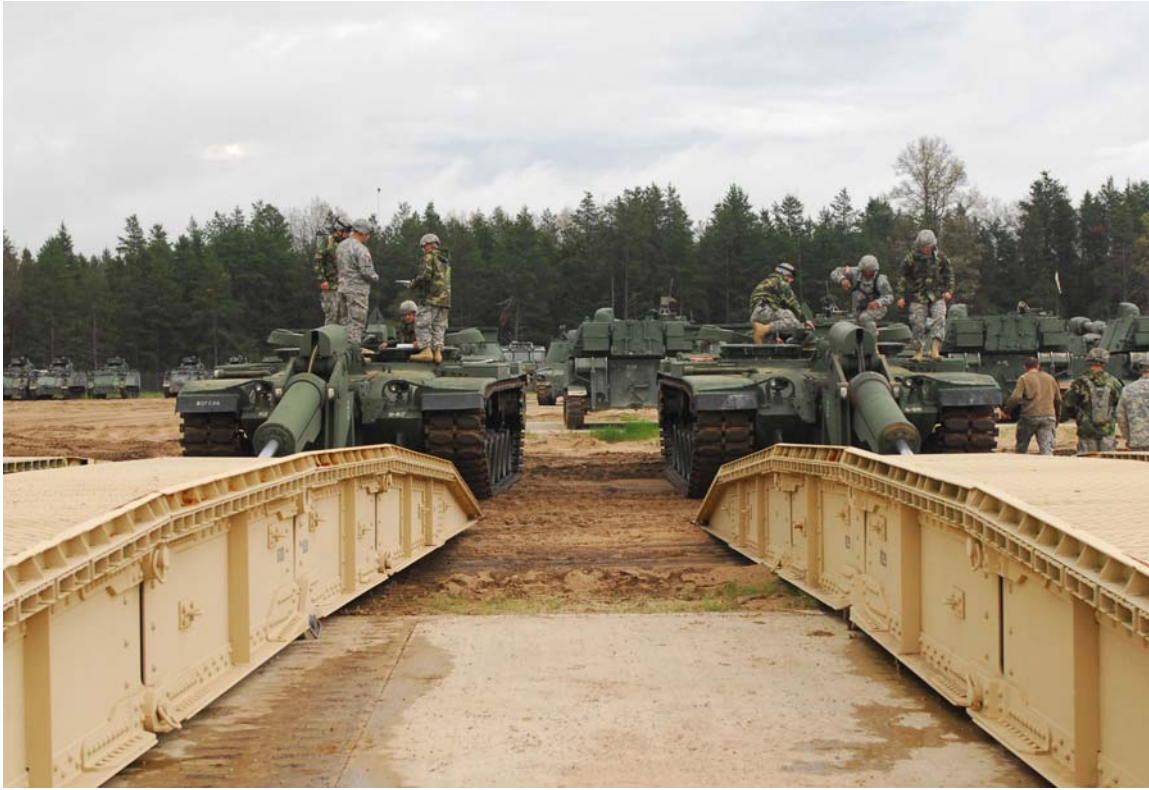
2008: Combat engineers with the Lorain, Ohio-based 837th Engineer Company train on the Armored Vehicle Launch Bridge June 11, 2008, at the Maneuvers Area Training Equipment Site during their annual training period at Camp Grayling, Mich.