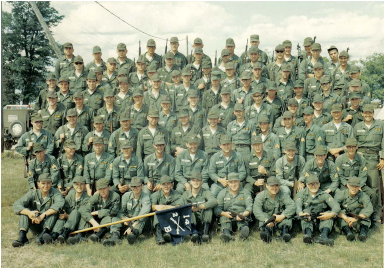
1965: Company B, 2nd Battalion, 145th Infantry, Camp Grayling, Mich., 1965.