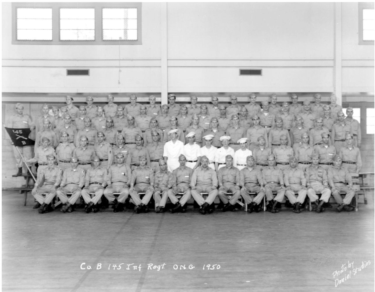
1950: Company B, 145th Infantry, Camp Atterbury, Ind., 1950.