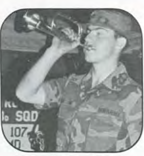
15 — Troop I Bugler Self-Made