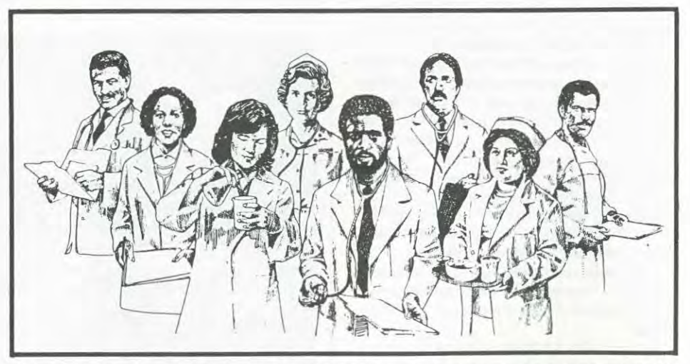
The Army medical team is studying ways to control the AIDS disease.

We have already alluded to the special problems that can occur in military personnel who are likely to enter combat. Also they may enter theaters of military action where there is a possibility of Chemical/Biological Warfare which would already impact upon