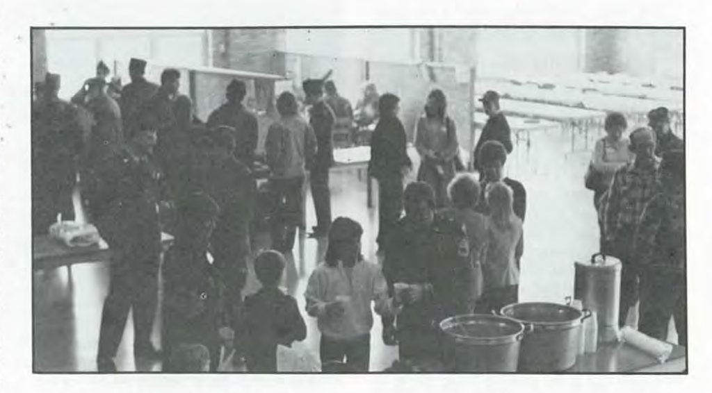
REFRESHMENTS SERVED — Families and employers of members of the 214th Maintenance Company at Coshocton and its Detachment 1 at Newark take time out for refreshments.