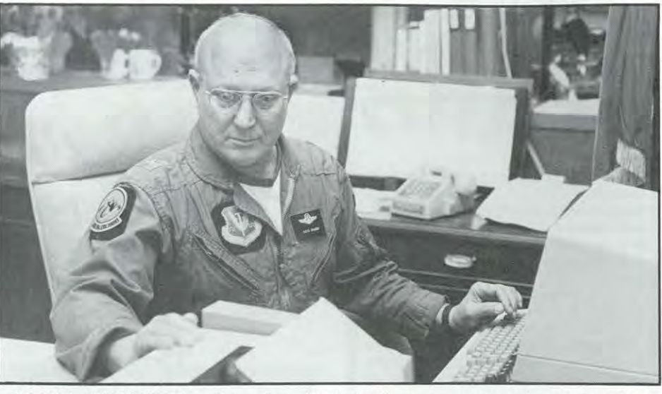
AT THE COMPUTER — Brig. Gen. Keith K. Kramer, commander of the 121st Tactical Fighter Wing now accomplishes the task of writing officer effectiveness reports on his Zenith 120 personal computer equipped with a Winchester hard disk. General Kramer says of his new office equipment and its capabilities: "It's a way of life."

Several standard, integrateable system computers are being used by the ANG. Among them are the Zenith 120 and 150, IBM PC, Sperry PC and Sperry UTS-40.