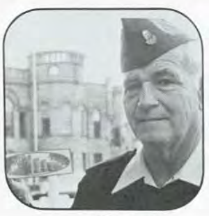
B — Old Armory Built Tough