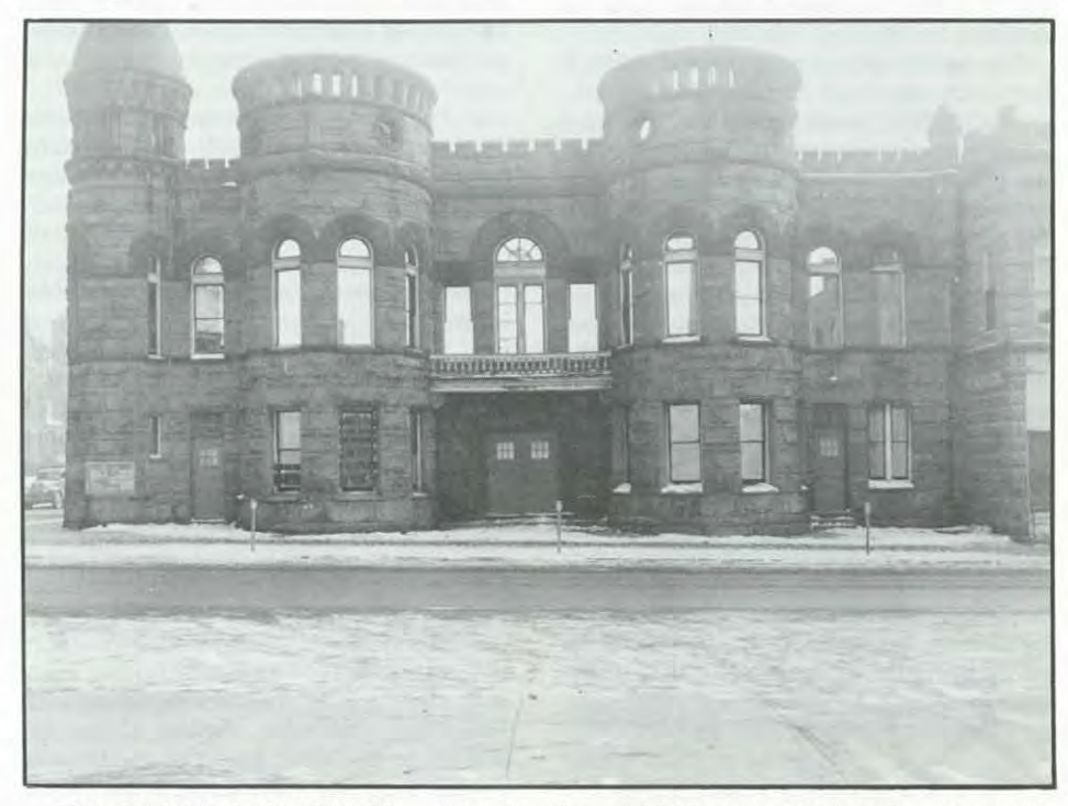
HISTORICAL LANDMARK — After the fire of 1947 gutted its interior, the cold winter winds had little affect on the massive stone walls of the Kenton Armory. Rebuilding was started the following spring, and the armory was operating once again in 1949.

The Kenton Armory has served the Ohio Army National Guard and the City of Kenton well. The massive stone walls have withstood the test of time and have become a historical landmark for the city and for the Ohio Army National Guard.